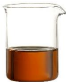
White Cypress Oil

A strikingly intense blue colour with captivating self-assured smokiness. Rich in Guaiazulene and Camazulene (German Chamomile), anti-inflammatory and antiviral properties create formulation opportunities.