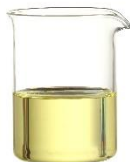
Australian Sandalwood Oil

A grounding and stabilizing aroma calms the agitated mind and body, while a high concentration of Guaiol offers a potential solution for rosacea and rashes, with demonstrated properties as a skin whitener.