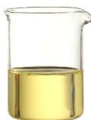
Indian Sandalwood Oil

A higher \alpha -bisabolol content (10-15%) than its Indian cousin makes Australian Sandalwood, with its smokey alluring notes, better suited for its documented anti-inflammatory and antiviral properties.